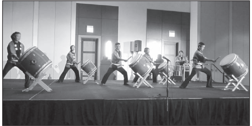
The Chicago Taiko Group entertain during the Sayonara Banquet