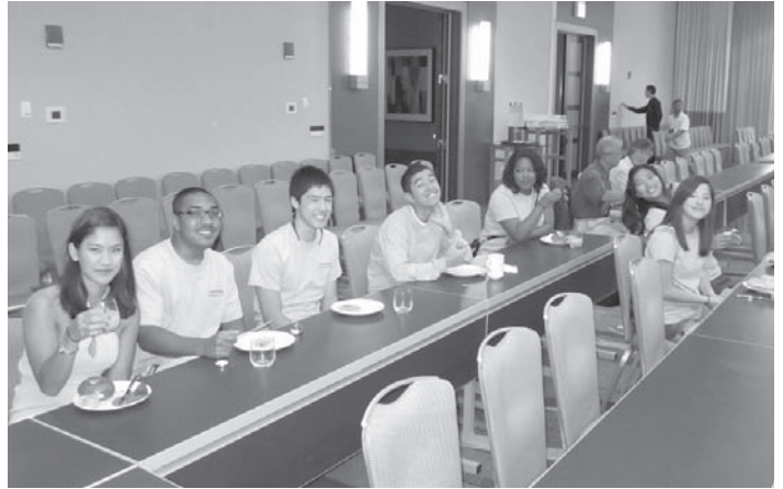
Portland JACL youth enjoy the continental breakfast before the first convention business session. Each of the youth were assigned to a delegate to learn some of the processes that happen during a convention.