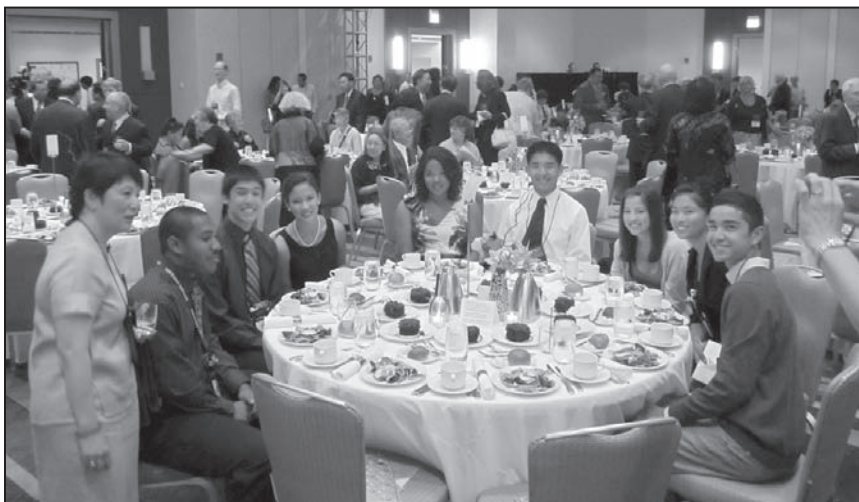
The Portland JACL youth group are all "dressed up" as they enjoy the Sayonara Banquet.