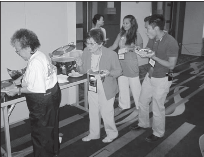
The opening mixer was a lot of fun, with Chicago deep dish pizza and hot dogs topping the snacks for the evening.