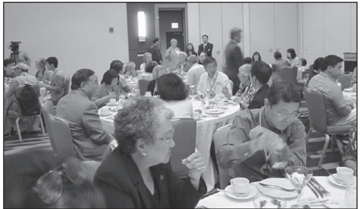
Delegates enjoy their lunch as they discuss some of the resolutions that had been brought up in the morning session.