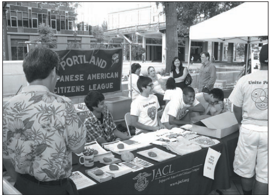
Right - Unite People staff the Portland JACL table at the Japanese American Historical 20th Anniversary Celebration