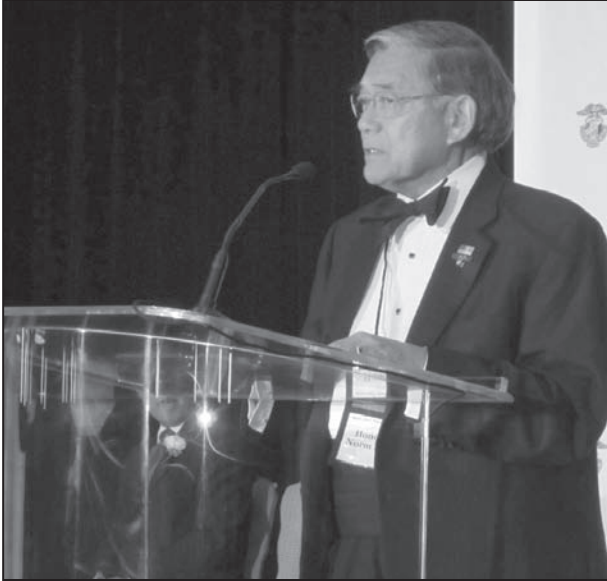
Former Secretary of Transportation Norm Mineta was the keynote speaker at the Sayonara Banquet