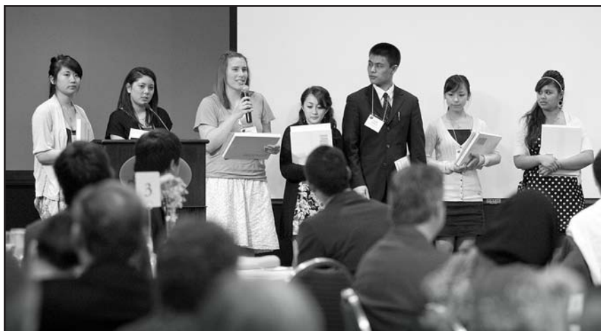
Left Scholarship recipients introduce themselves at the 2010 Japanese American Graduation Banquet.