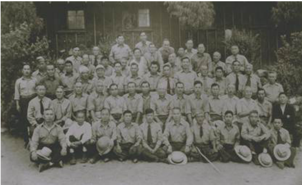
Oregon Inmates at the Santa Fe Department of Justice Camp, ONLC 01751

In support of the mission of Oregon Nikkei Endowment, the Center for Japanese Studies and the Center for Public Humanities at Portland State University will also be sponsoring special lectures and programs relevant to this exhibit.