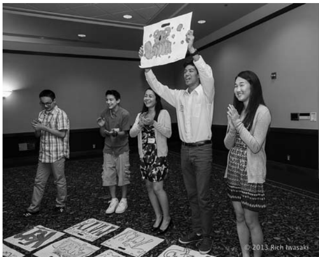
Members of Unite People cheer on scholarship recipients at the 2013 Japanese American Graduation Banquet, Multnomah Athletic Club, Portland, Oregon