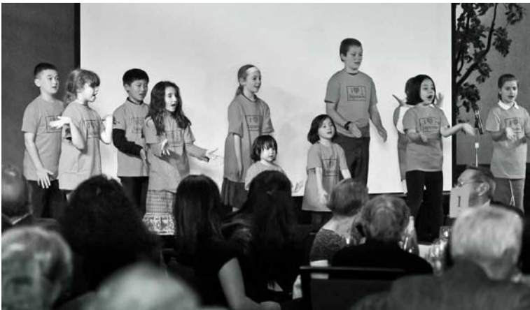
Students from The International School perform at the 2011 Oregon Nikkei Endowment banquet