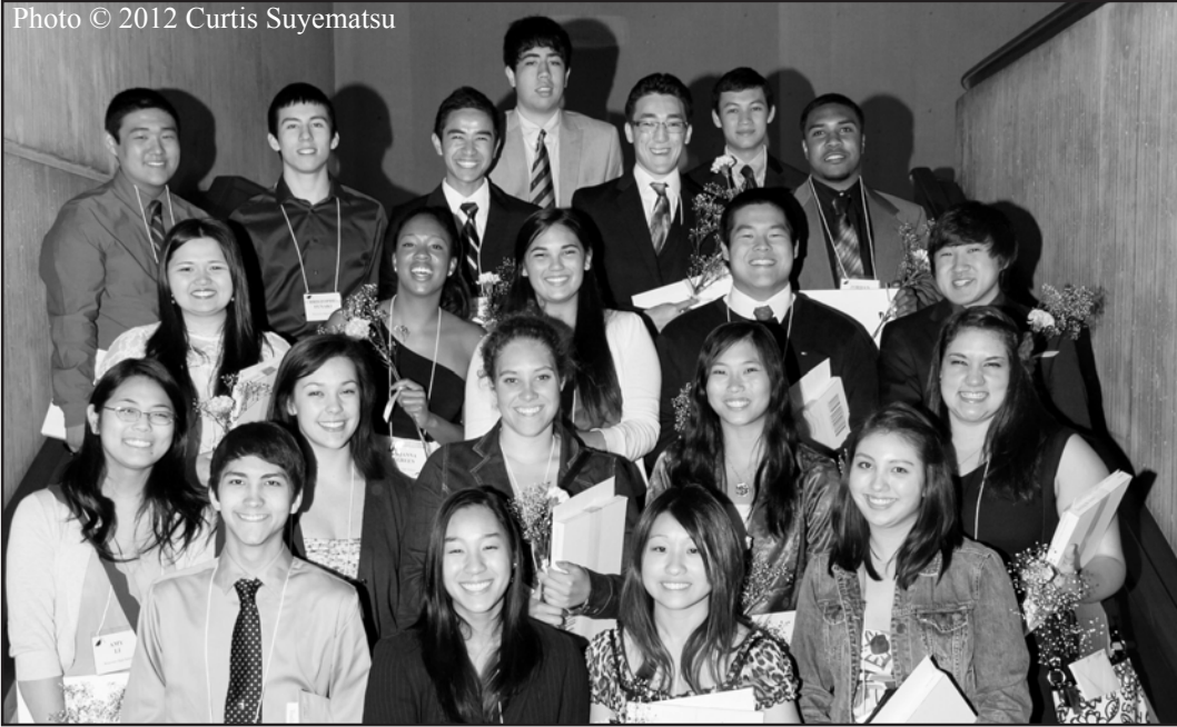
The Class of 2012 graduates pose for a quick photo at this year's Japanese American Graduation Banquet, Multnomah Athletic Club, Portland, Oregon