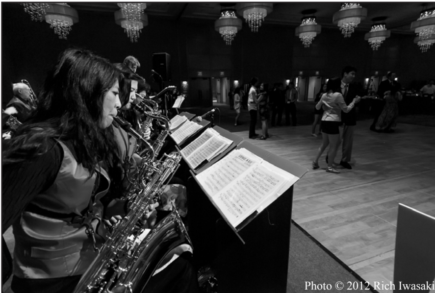
The Minidoka Swing Band performs at the Sayonara Banquet of the 2012 JACL National Convention, Grand Ballroom, Bellevue Hyatt Regency hotel, Bellevue, Washington.