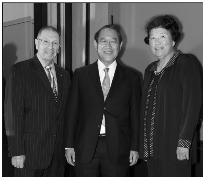
Chip and Setsy Larouche with Ambassador Fujisaki