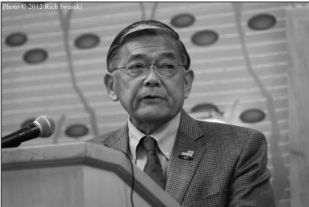
Secretary Norman Mineta speaks at the National Council session