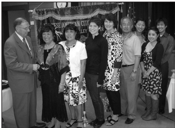
Governor Chip Larouche swears in the Puyallup Chapter JACL Board.