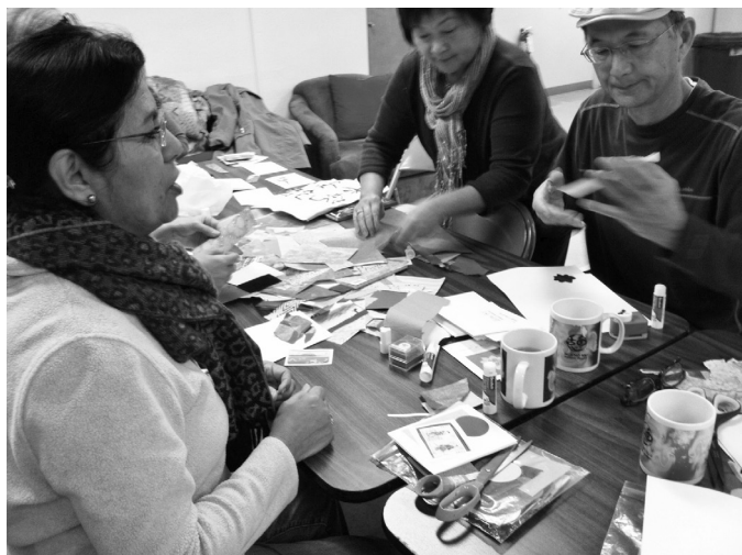
Card making day at Ikoi no Kai brings together people of all ages to create unique Asian note cards. Sales from these cards help support Ikoi no Kai's Monthly Bento Project for the home bound members of the Nikkei community.