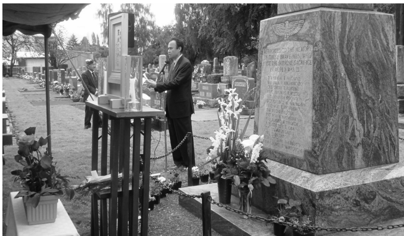
Consul General Hiroshi Furusawa addresses the attendees at the annual Memorial Day service at the Rose City Cemetery.