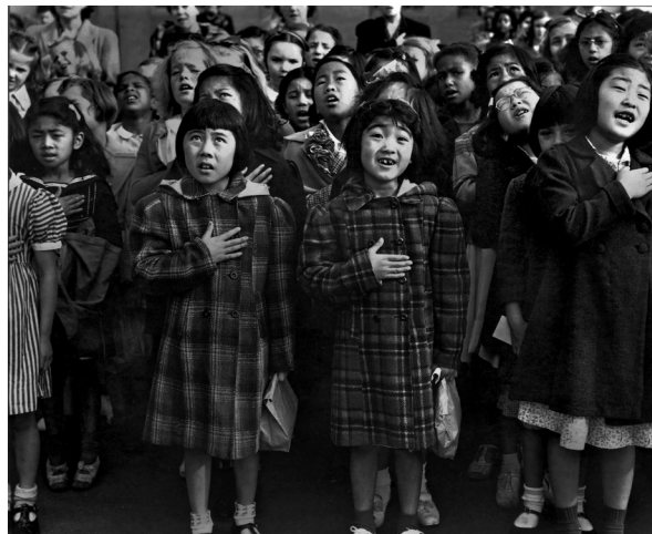
Children of the Raphael Weill public school, from the so-called international settlement in San Francisco, CA, shown in a flag pledge ceremony in April 1942. This photograph was taken by War Relocation Authority photographer Dorothea Lange shortly before the forced removal of all persons of Japanese ancestry from the West Coast.

Save the Date! Portland JACL General Membership Meeting Thursday, October 15, 2015 7 p.m. Refreshments will be served