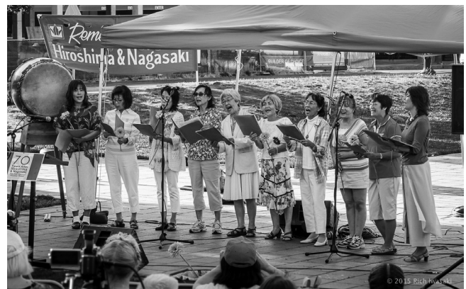
Members of the Tomodachi Chorus perform during the Hiroshima & Nagasaki remembrance event, Japanese American Historical Plaza, Tom McCall Waterfront Park, Portland, Oregon