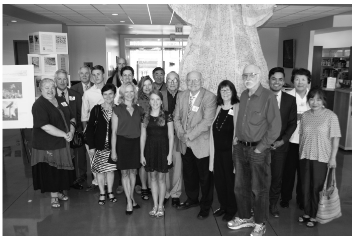
Group photo at Wholistic Peace Institute's recent exhibit of HIROSHIMA – Never Again at Concordia University.