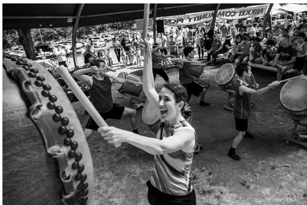
Members of Portland Taiko perform for attendees at the Nikkei Community Picnic. Oaks Park, Portland, Oregon