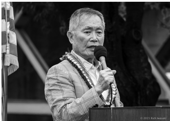
Actor and activist George Takei gives the keynote address at the Japanese American Historical Plaza 25th Anniversary celebration, Tom McCall Waterfront Park, Portland, Oregon