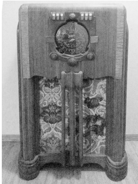
A Japanese Family in Gresham gave this radio away in 1942. Radio conservationists are looking for them and want to give it back.