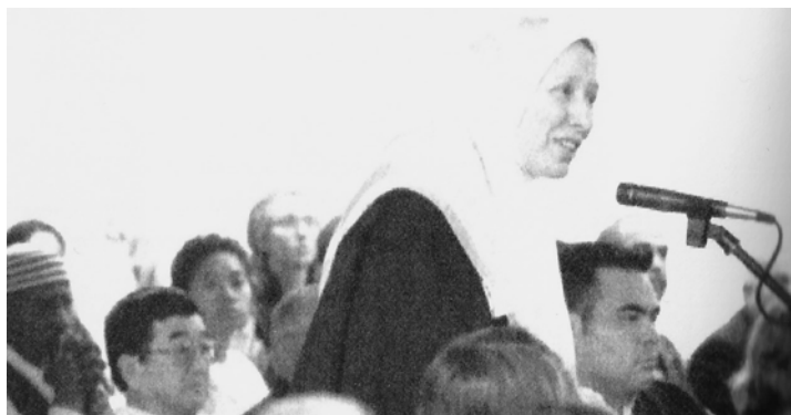
Portland JACL's Dialogue for Peace and Understanding in 2001.

(IRCO), Asian Pacific American Network of Oregon (APANO), Muslim Educational Trust (MET), Unite Oregon, Basic Rights Oregon, and so many more can use our attention and advocacy.