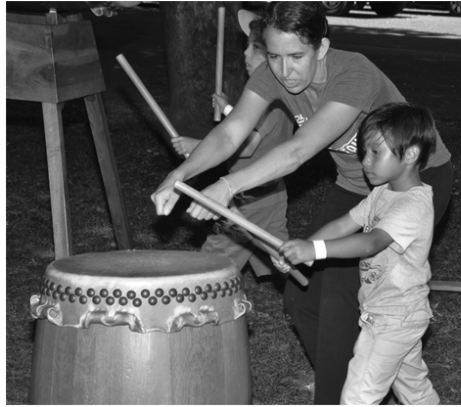
Portland Taiko runs their own version of Portland's Got Talent.