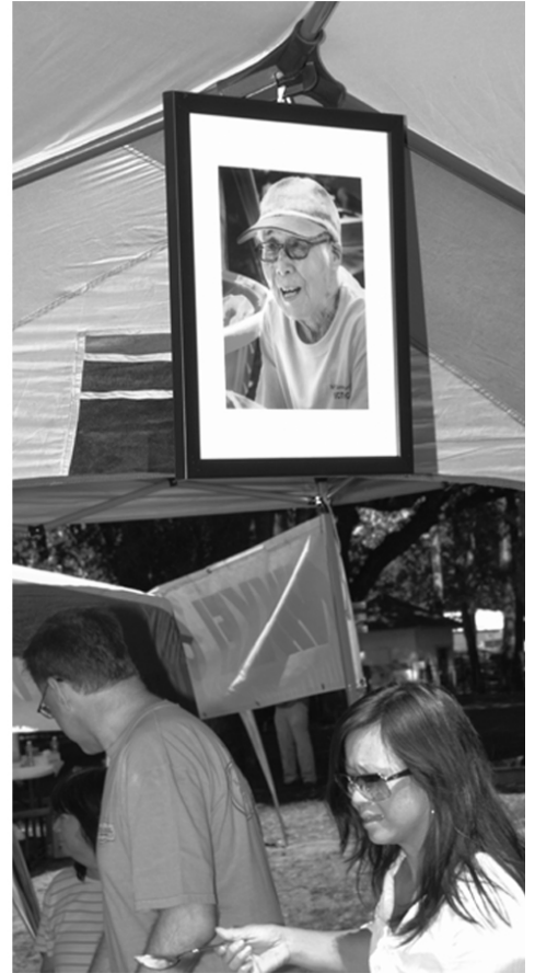
We all missed you Nobi-san.