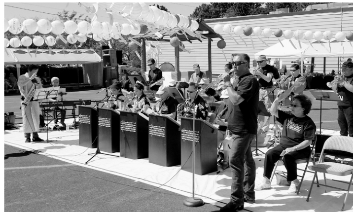
Minidoka Swing Band was the lead entertainment at Oregon Buddhist Temple's Obon Festival on August 6. Unlike the sweltering temperatures of years past, this year was a very pleasant 75°.