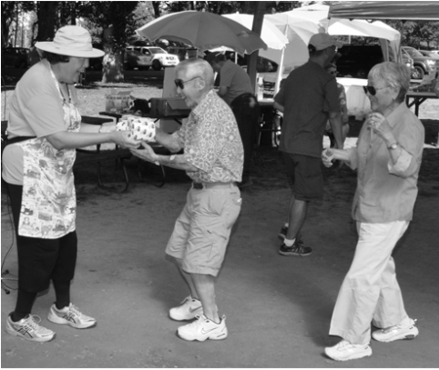
The Tsugawas eagerly claim their traditional picnic prize for the less lucky attendees.