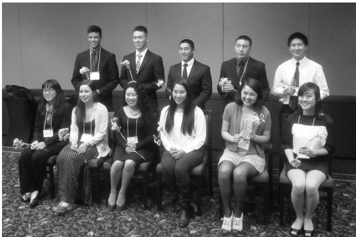
There were 11 graduating seniors honored on May 4th at the 67th Annual Japanese American Graduation Banquet.