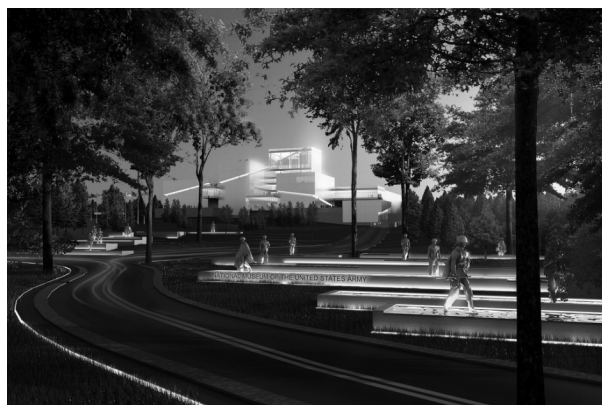
Architectural Rendering of New National Museum of the US Army.