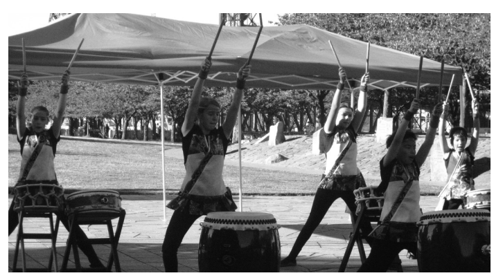
en Taiko ensemble perform at the Hiroshima-Nagasaki Memorial Service at the Japanese American Historical Plaza on August 6th.