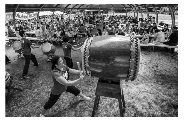
Members of Portland Taiko perform at the 2014 Nikkei Community Picnic, Oaks Park, Portland, Oregon.