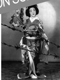
"Hidden Legacy: Japanese Traditional Arts in the WWII Internment Camps"