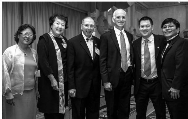
The National JACL Gala was held in Washington, DC on October 9th. Pictured here is The Honorable Adam Smith, Congressman from the 9th Congressional District in Washington State, who was one of the honorees for the evening.