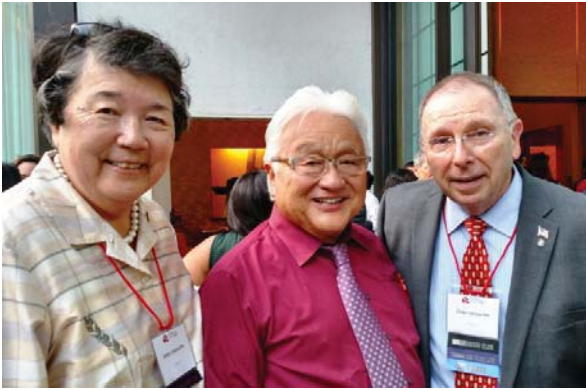
Former Congressman Mike Honda was at most Convention activities including the reception at the residence of the Ambassador of Japan to the United States