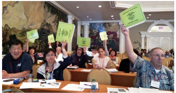
Pacific Northwest District voting on Resolutions

Willamette Heritage Center, 1313 Mill Street SE, Salem, Oregon