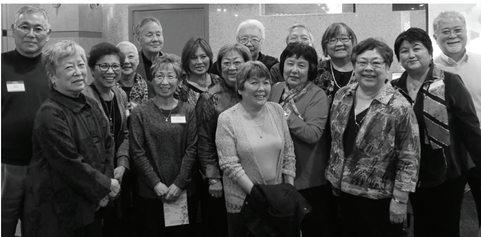
The planning committee for the 40th Anniversary Celebration for Iko No Kai Senior Lunch Program takes time to pose for a photo.