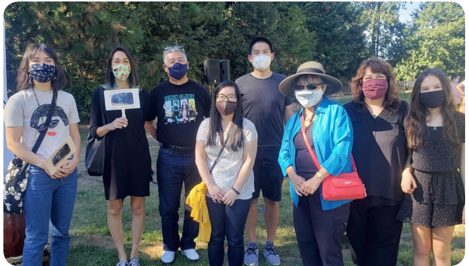
Portland JACL supports Portland Taiko at the outdoor performance at Oaks Park.