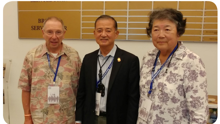
General Shinseki and Chip & Setsy Larouche.