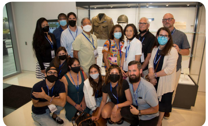
The large Iwasaki family representation.