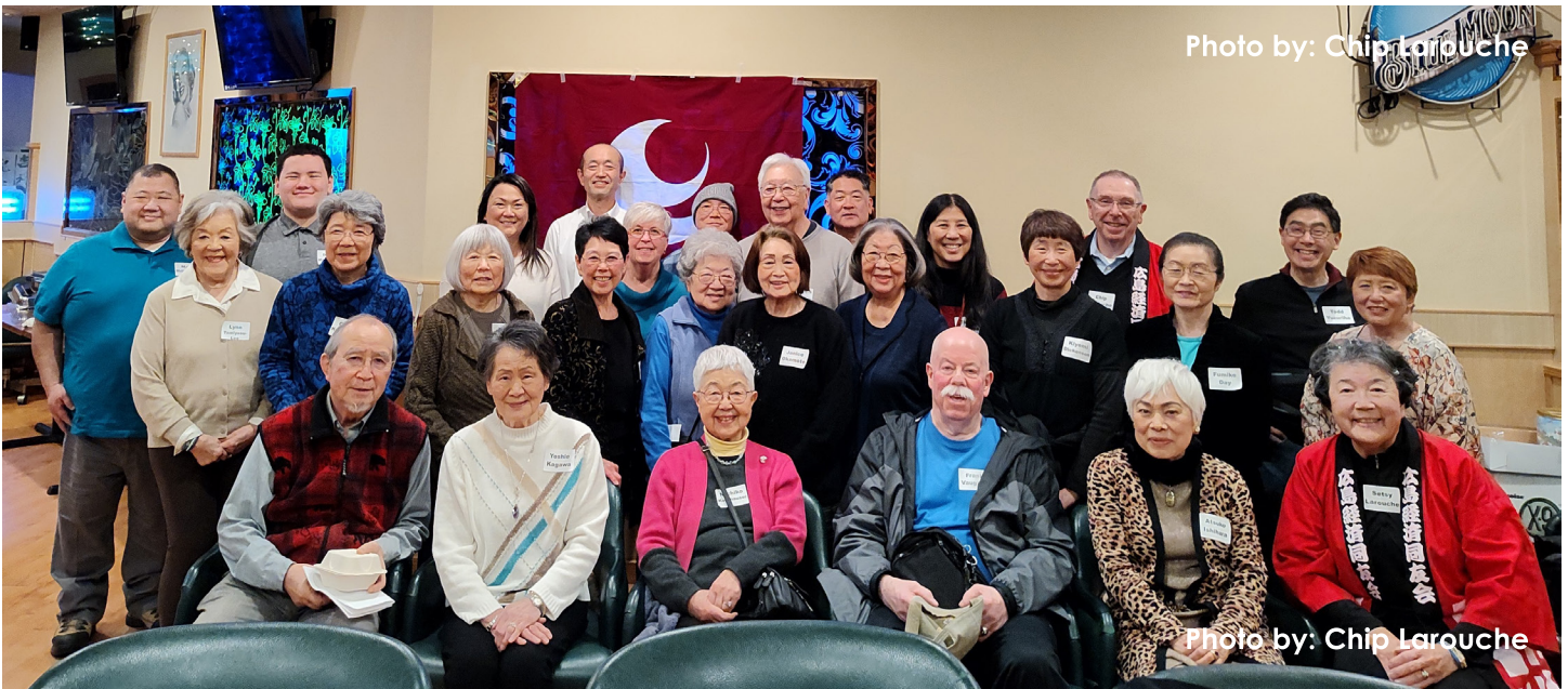
The Oregon Hiroshima Club held their annual Shinnenkai celebration on March 2, 2024 at the Dragon Palace restaurant. The ice/snow storm in January delayed the celebration.