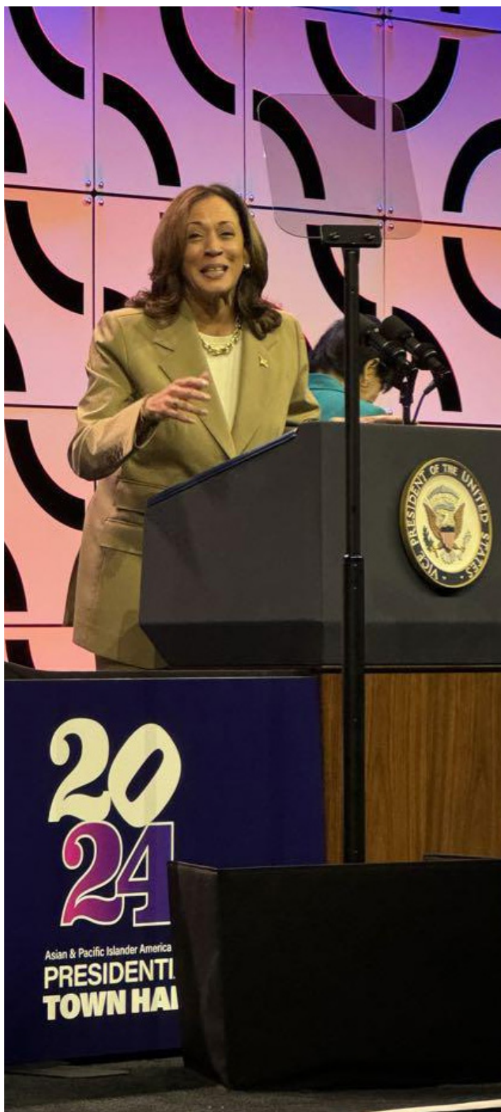
Vice President Kamala Harris spoke at the Presidential Town Hall held at the Philadelphia Convention Center on July 13, 2024.