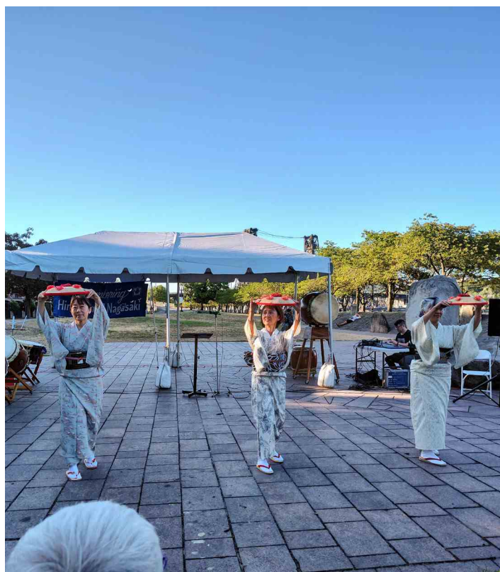
Members of the Tsubaki Buyo Doukou Kai Dancers performed at the JA Historical Plaza for the annual Hiroshima/Nagasaki Day ceremony on Aug 6, 2024.