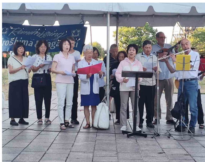
The Hiru Gohan Group from Ikoi No Kai played a song at the annual Hiroshima/Nagasaki Day ceremony on Aug 6, 2024 at the JA Historical Plaza.