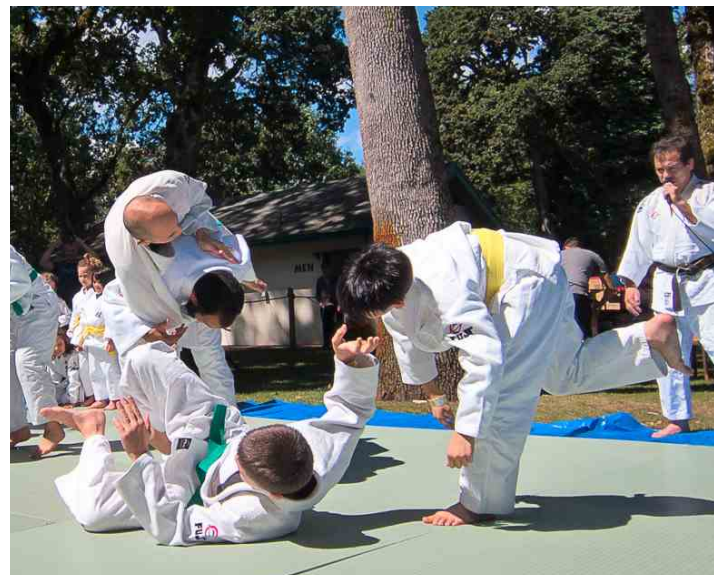
Picnic Entertainment.