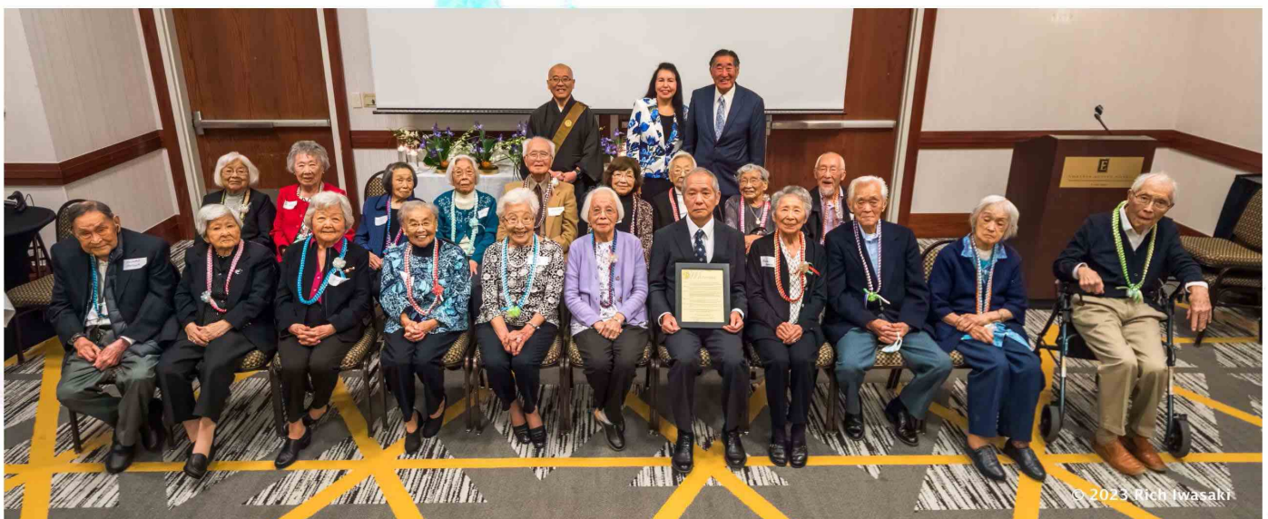
Embassy Suite by Hilton Portland Airport, Portland, Oregon